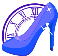
R&H'S CINDERELLA FALL 2026: OCT 23, 24, & 25

May We Text You? Yes or No Are You a BTG Member? Yes or No